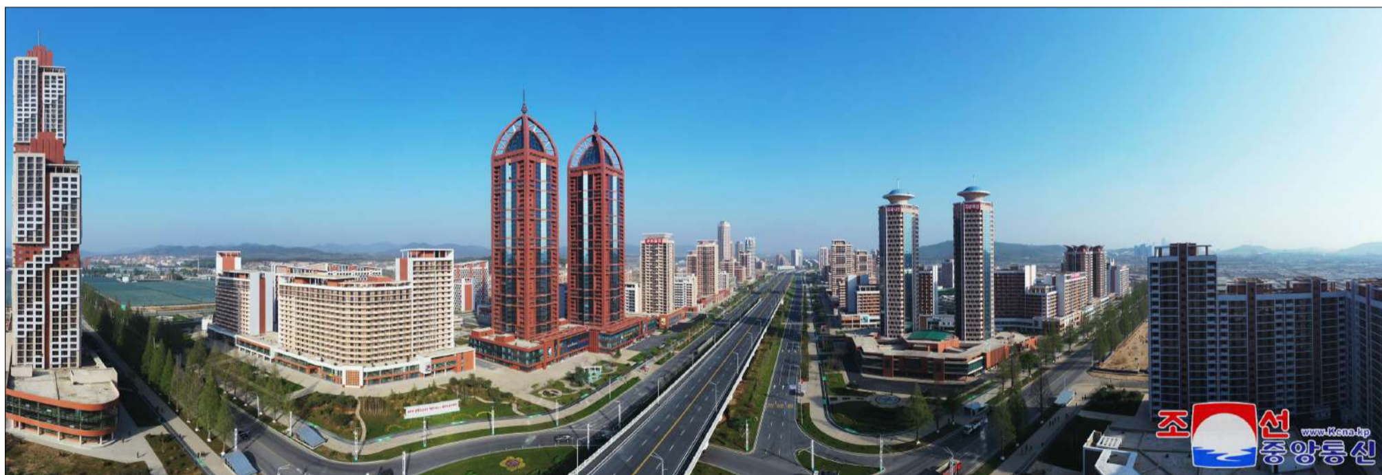
New dwellers begin to move into their houses on Hwasong Street, a new street built in Pyongyang.