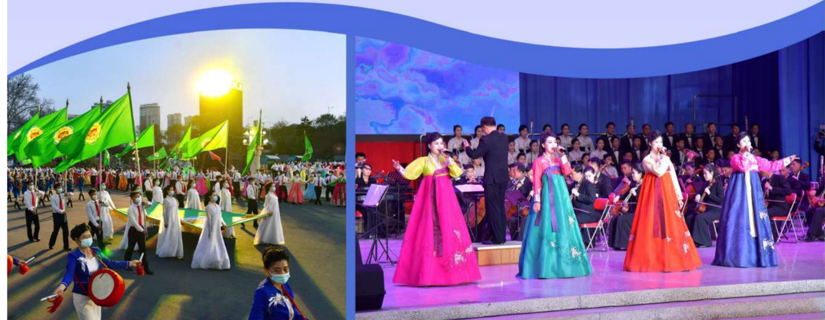
Performances of the Eighth April Spring People's Art Festival are given at different theatres in Pyongyang to mark the Day of the Sun.

The audience unsparringly applauded the magicians who decorated the festival stage conspicuously.