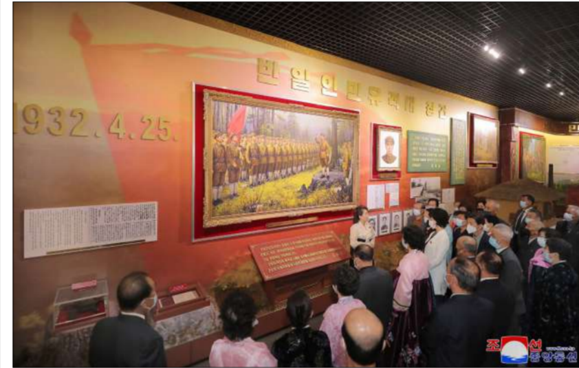
Descendants of anti-Japanese fighters and those related to the anti-Japanese revolutionary struggle visit the Korean Revolution Museum.

Being briefed on the immortal exploits of President Kim Il Sung who achieved the historic cause of the country's liberation in several rooms of the Hall for Period of Anti-Japanese Revolutionary Struggle, they looked round the photos, relics and other materials.