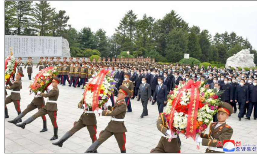
A wreath laying ceremony takes place at the Revolutionary Martyrs Cemetery on Mt Taesong on April 25.

W reaths were laid at the Revolutionary Martyrs Cemetery on Mt Taesong in Pyongyang on April 25 on the occasion of the 91st anniversary of the founding of the Korean People's Revolutionary Army.