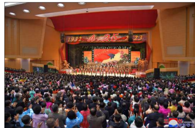
The Song and Dance Ensemble of the Ministry of National Defence gives a performance to mark the 91st anniversary of the KPRA at the April 25 House of Culture.