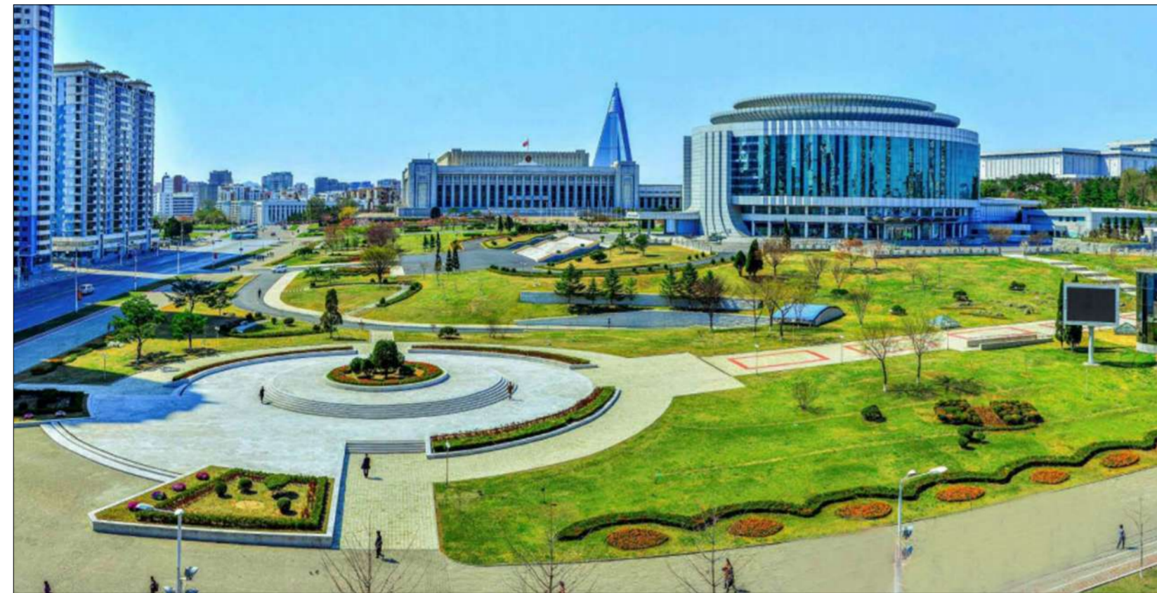
Various species of flowering plants are arranged harmoniously and a distinctive round flower bed formed around the People's Theatre.