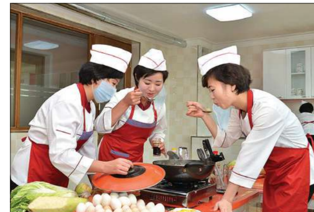
Employees of the Sinuiju Textile Mill (left) and the Pyongyang Kim Jong Suk Textile Mill (right) spend a pleasant time at the workers' hostels after a day's work.