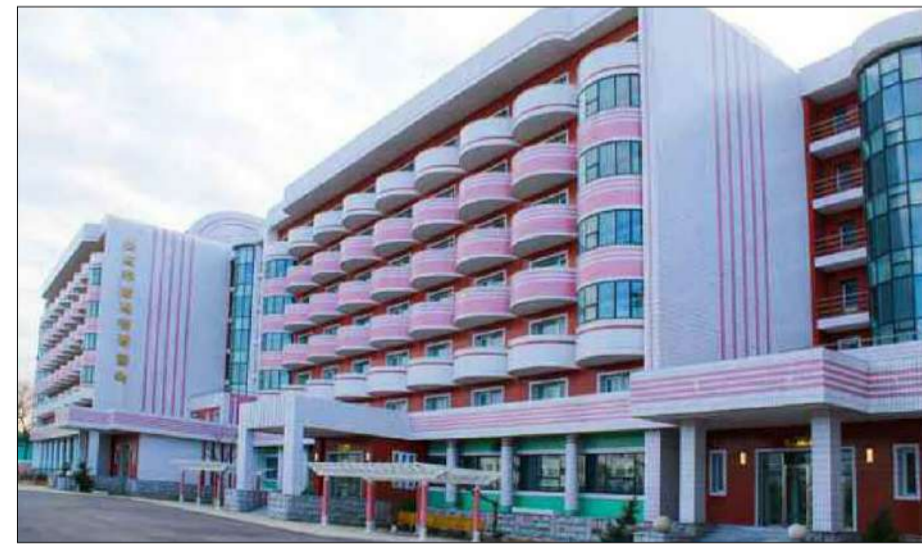
The workers' hostel built at the Sinuiju Textile Mill as a home of its girl employees.

Every weaver living in the hostel says they would work harder to hand down his boundless paternal love generation after generation.