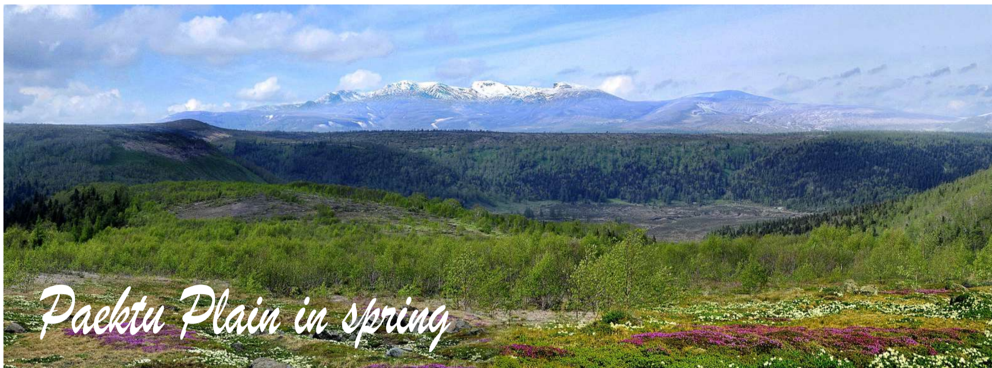
Paektu Plain in spring