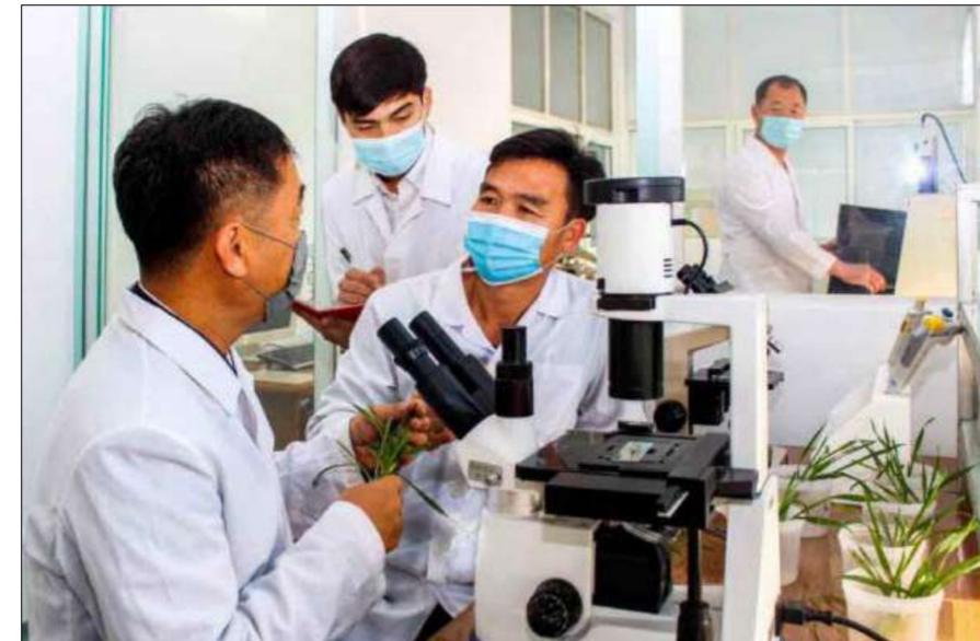
Scientists discuss during research into high-yielding wheat cultivation technology at Pyongyang University of Agriculture.