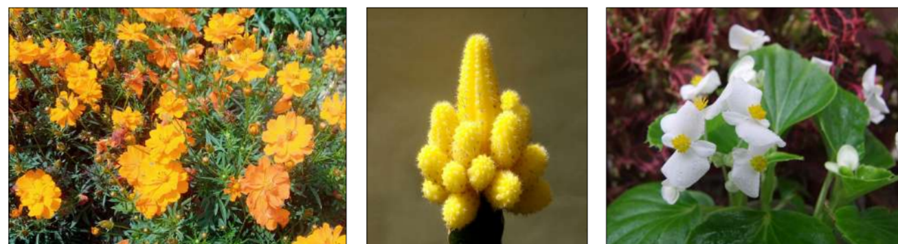
Yellow cosmos "Gold", Chamaecereus silvestrii "Yellow Jade" and perpetual begonia "White".